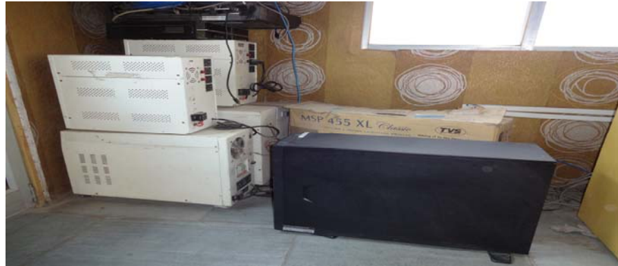
Hardware lying idle in Central Jail Indore 25-4-2015