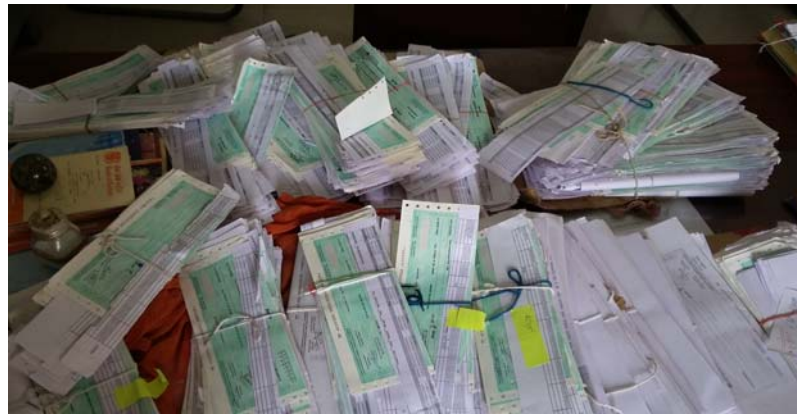
Banker cheques lying idle at Zila Panchayat, Bhopal

Scrutiny of records of pension payment in seven selected districts 2 revealed that undisbursed pension of ₹ 1.32 crore relating to NSAP/SSSPS was returned by bank to the district offices in the form of demand draft/Banker cheques. However, the lists of such pensioners were not given by banks. Out of these undisbursed pensions, ₹ 52.12 lakh was deposited in bank account of respective disbursing authorities and ₹ 79.79 lakh was lying idle in the mode of Banker cheques/ Demand draft at District level. Due to non-credit of pension in beneficiaries' account, they were deprived from benefit of scheme from November 2013 to June 2015.