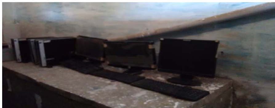
Hardware lying unutilised in Circle Jail, Datia 23-3-15

In the exit conference, ACS stated that the work was done by NIC and final adjustment would be made in co-ordination with NIC.