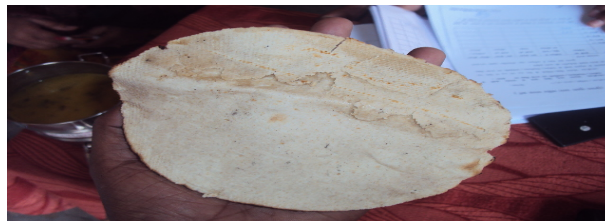
Half baked Roti served by NGO at Primary School Vijay Nagar Bhopal city, Dated 12.03.2015