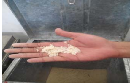
Larvae infected rice at M S Khodri, Block-Jaithari, District Anuppur, dated 07.04.2015

schools sufficient number of utensils for storing and serving of MDM were not found. Food grains (Rice) was found pest infected in district Anuppur.